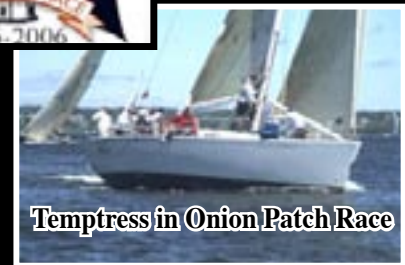
Temptress in Onion Patch Race