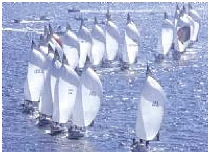
Rolex Farr 40 World Championship 2006

The key here is being prepared. Many years ago I crewed on a boat participating in Off-Soundings Race. The morning the race started off New London, CT we had great wind (a little too great as we would later find out). We were reaching with our spinaker up, going about 14 knots, when all of a sudden we rounded up. It took a minute to figure out that our rudder had sheared off at the waterline. Several boats were going by and hailed us to make sure we were alright. We waved them off and proceeded to put the outboard on the stern to power to shore. This incident happened in "the race" so we were not that far from shore and we were not worried.