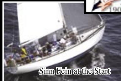
Sinn Fein at the Start